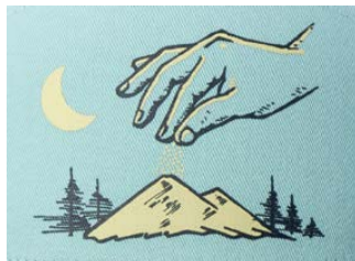
TWO COLOR SCREEN PRINT TRANSFER