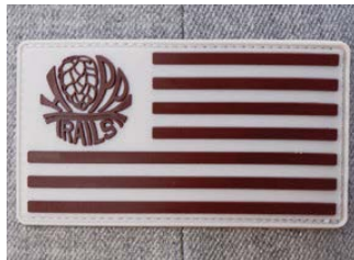
OD092 | RUBBER PATCH