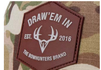
OD089 | RUBBER PATCH