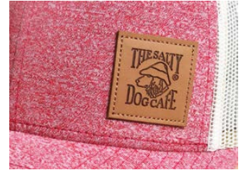
FAUX DEBOSSSED LEATHER, BROWN IMPRINT