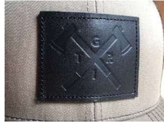
GENUINE DEBOSSSED LEATHER, TONAL IMPRINT