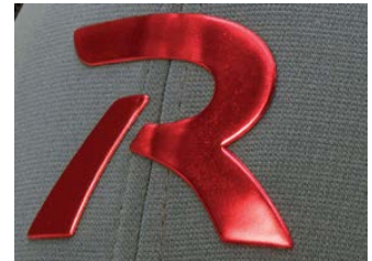
METALLIC POLY PRESS TRANSFER