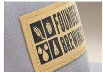
OD109 | SUBLIMATED LABEL