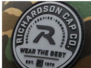
OD291 | RUBBER PATCH