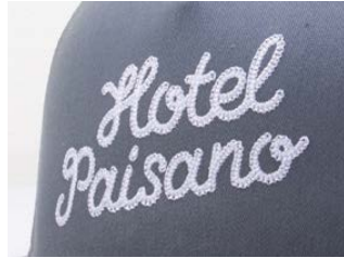
CL175 | ROPE STITCH EMBROIDERY