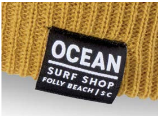
OD211 | WOVEN CLIP LABEL