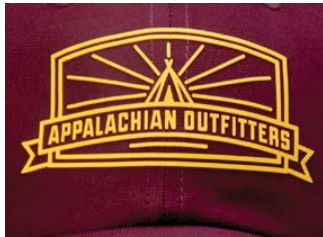
OD120 | SILICONE TRANSFER