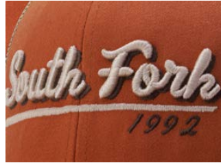
CL115 | 3D EMBROIDERY