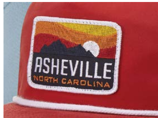
OD044 | EMBROIDERED PATCH