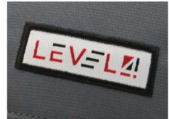
WOVEN LABEL W/ SATIN STITCH TACKDOWN