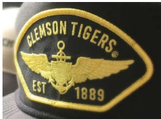
CL122 | EMBROIDERED PATCH