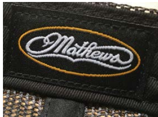
WOVEN INTERNAL LABEL