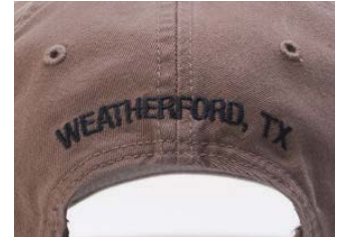
SECONDARY POSITION EMBROIDERY