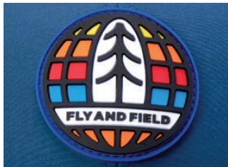
OD028 | RUBBER PATCH