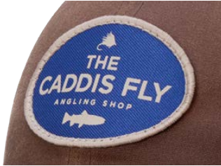
SCREEN PRINTED PATCH