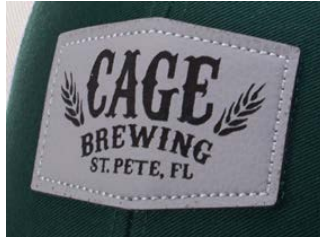
FAUX ETCHED LEATHER APPLIQUE