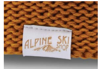
CL205 | FAUX LEATHER CLIP LABEL