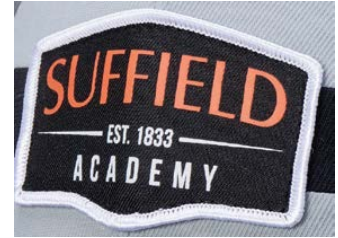
OD086 | SCREEN PRINTED PATCH