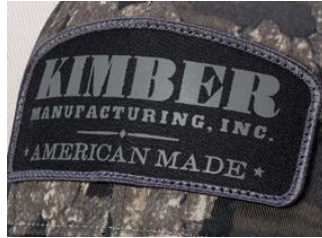
SCREEN PRINTED PATCH