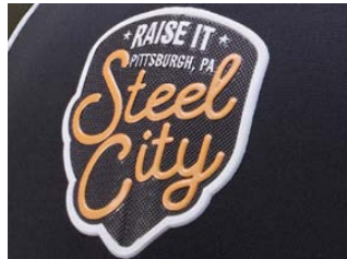
OD124 | NON-METALLIC POLY PRESS TRANSFER