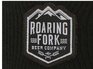
LASER CUT WOVEN PATCH