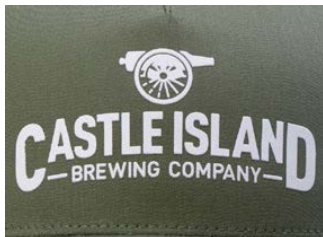
OD338 | ONE COLOR SCREEN PRINT TRANSFER