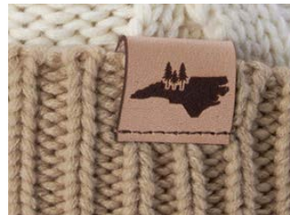
LEATHER CLIP LABEL