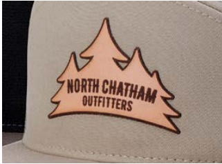
OD217 | GENUINE ETCHED LEATHER APPLIQUE