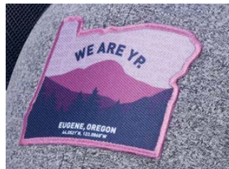
LASER CUT SUBLIMATED PATCH