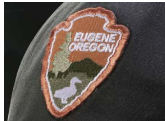
OD040 | LASER CUT EMBROIDERED PATCH