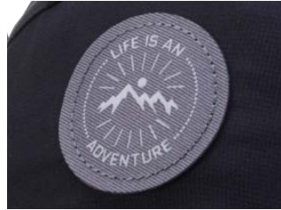
OD110 | SCREEN PRINTED LABEL