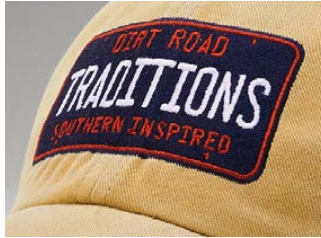
CL112 | STANDARD EMBROIDERY