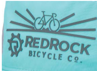
OD223 | SILICONE TRANSFER