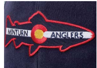
OD250 | LASER CUT EMBROIDERED PATCH