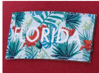
OD104 | WOVEN LABEL