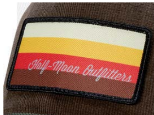
OD263 | SUBLIMATED PATCH