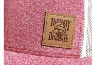
FAUX DEBOSSED LEATHER, BROWN IMPRINT