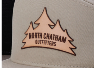
0D217 | GENUINE ETCHED LEATHER APPLIQUE