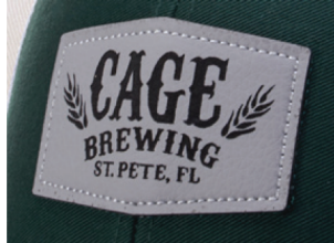
FAUX ETCHED LEATHER APPLIQUE