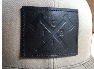
GENUINE DEBOSSED LEATHER, TONAL IMPRINT